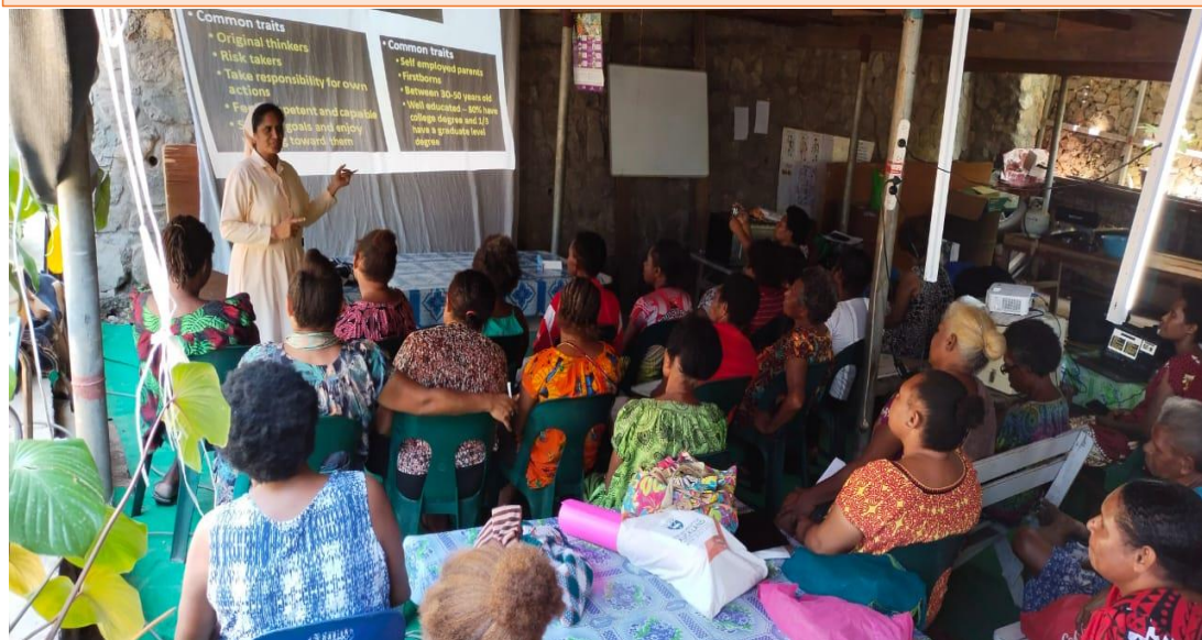
Women enhance their entrepreneurial skills. Women improve their additional skills