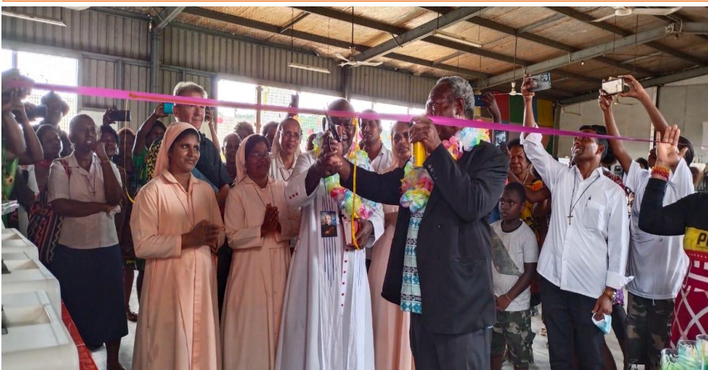
Inauguration of Skill Training Centre for women to learn tailoring and catering skills