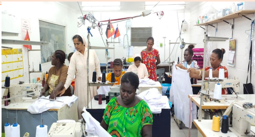
Orientation and Training on Tailoring Skills