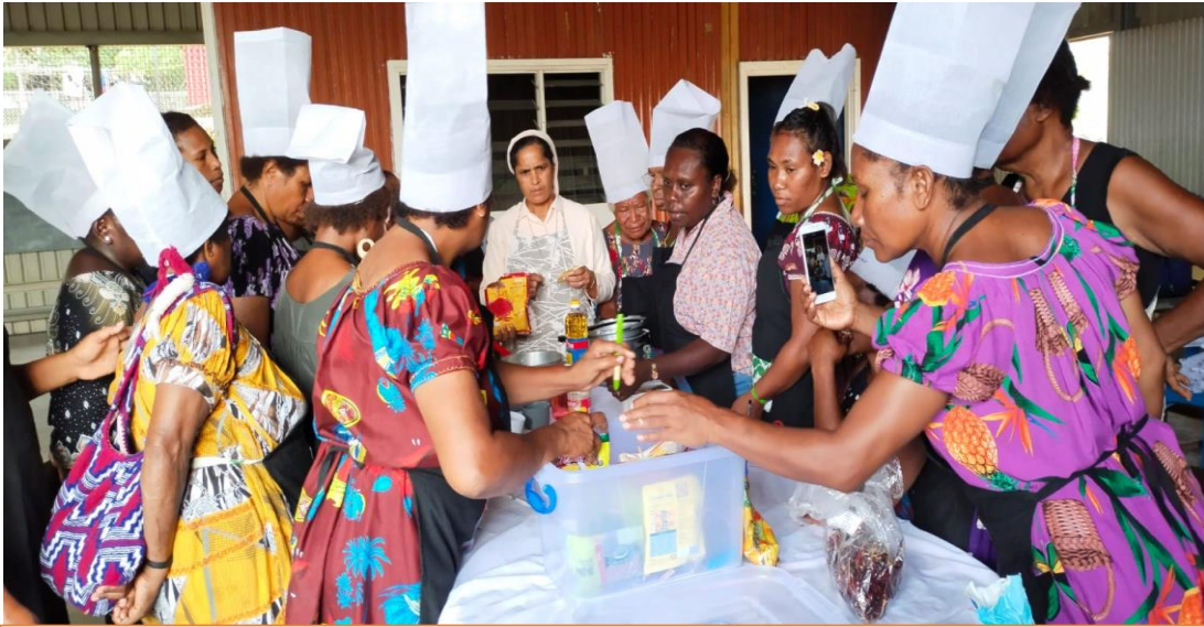
Women enhance their catering skills