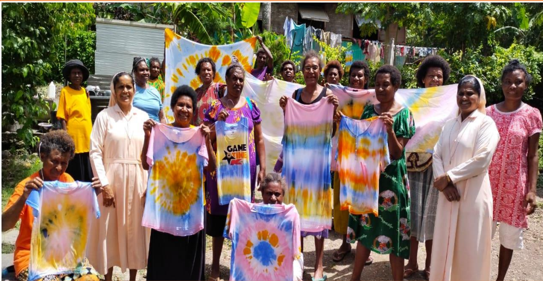
Women learned to design clothing and prepare paper mugs