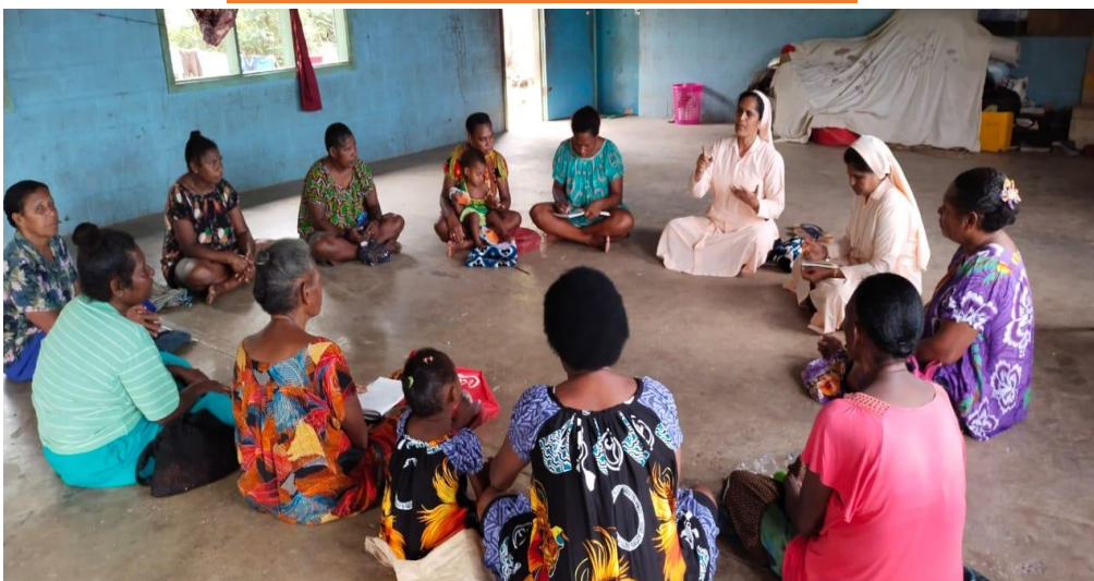
DMI team organised a regular group meeting for women members.