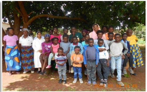
The DMI sisters and MSFS Fathers supported 17 children have access to formal education.