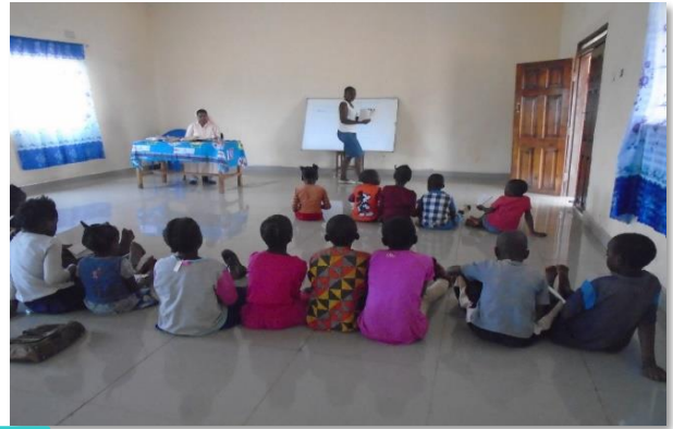
Education Support to the Vulnerable Children