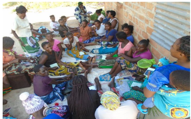
Capacity Building - Training on Time Management, leadership and Book Keeping