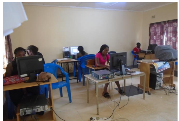
DMI Vocational Training in Lusaka and in Chipata

71 students learn catering, beautician, computer and tailoring courses from DMI organization.