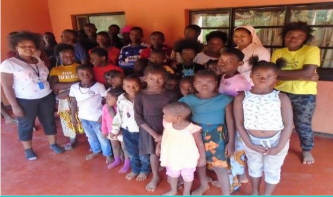
Children Parliament - Formed and strengthen children parliaments to practice parliament system, improve their leadership skills and safeguard their rights.