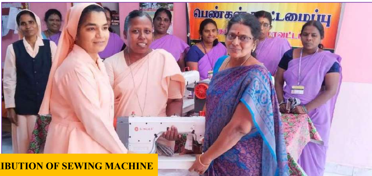
DISTRIBUTION OF SEWING MACHINE