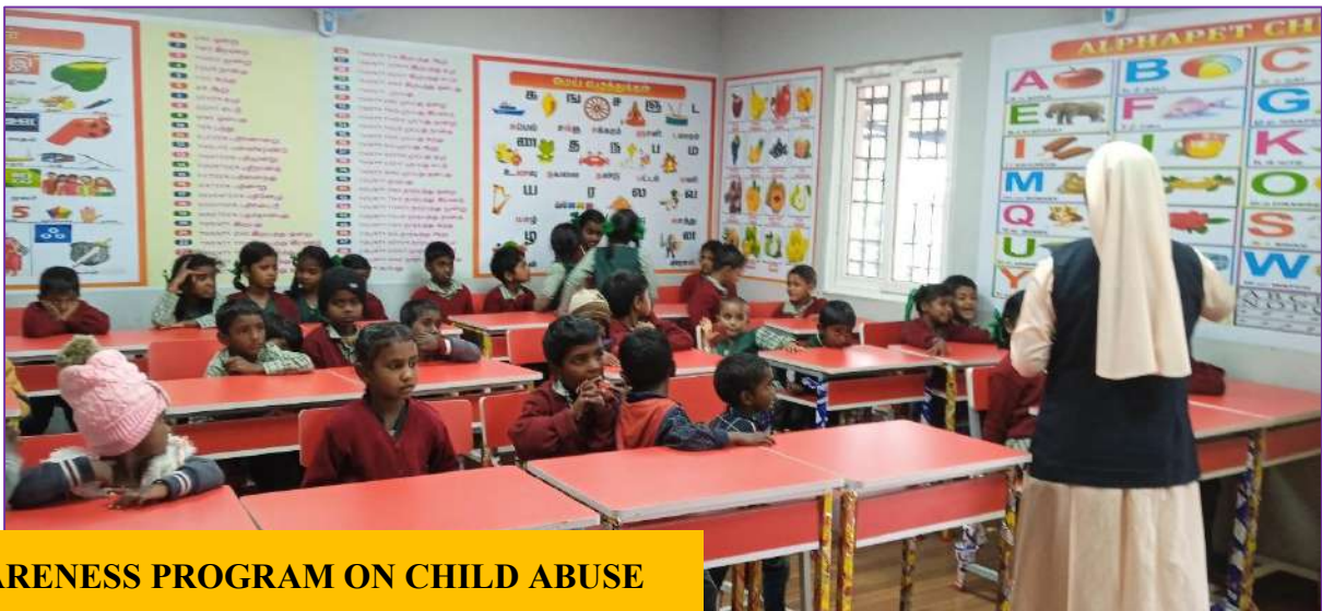
AWARENESS PROGRAM ON CHILD ABUSE