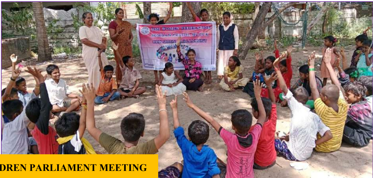
CHILDREN PARLIAMENT MEETING