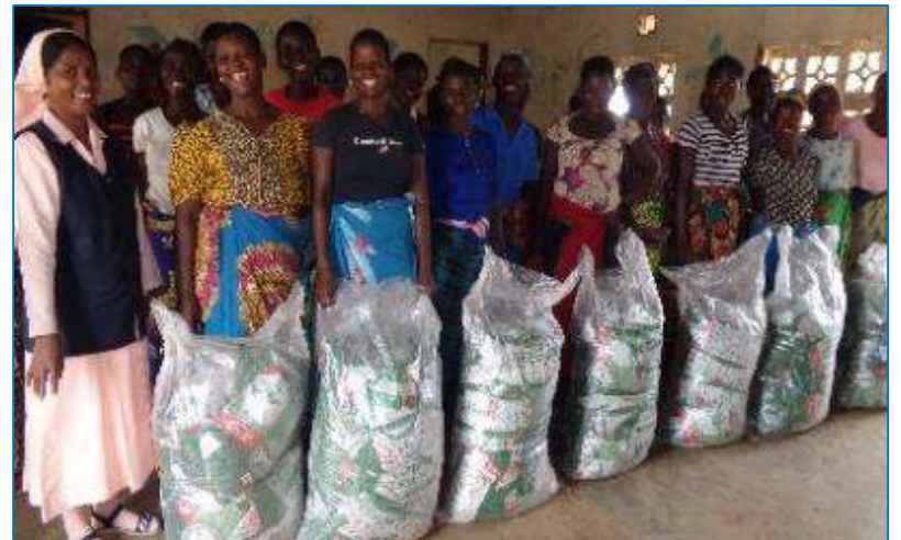
Federation Loan distribution (benefit out of maize seed)