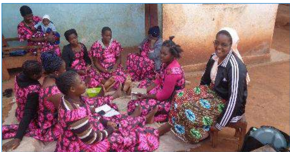
Training Programs for Women