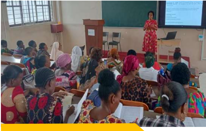
cro - research Seminar for women group