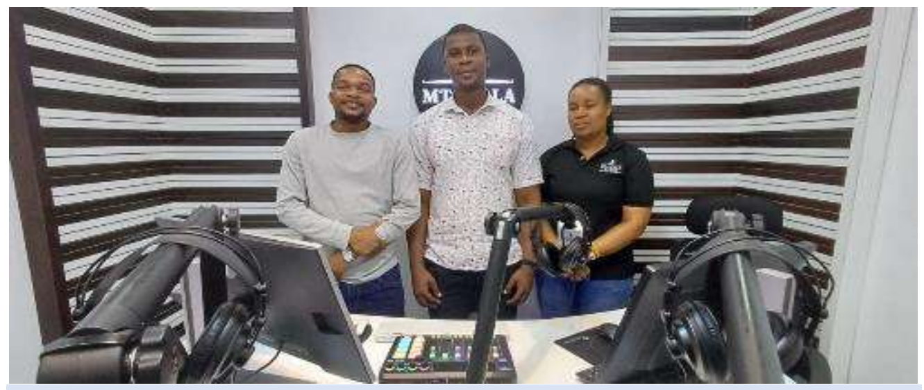
Media coverage- DMI organized 3 radio shows and 1 television programs focusing on human trafficking issues and those were aired on 11<sup>th</sup> June 2023, 15<sup>th</sup> June 2023, 16<sup>th</sup> June 2023 and 10<sup>th</sup> October 2023 at KISS FM radio, Mlimani TV and Mtawala radio.

Micro Research- DMI team has done microresearch on the title of 'The contribution of vocational education in improving the economic status of the reunified survivors of human trafficking from DMI Spring of Hope – Tanzania.' The key findings of the research will be published in 2024.