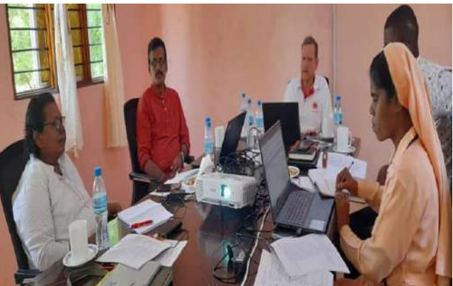
Monitoring visit, Caritas International, Germany