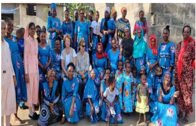
Visit of Mano Unidas, Spain- visited Women Headed Families in Dar es Salaam